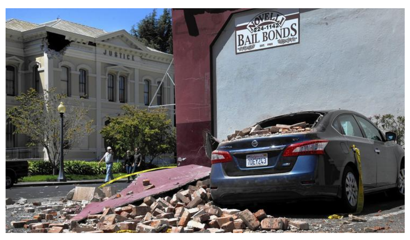
Falling bricks caused damage in downtown Napa in the Aug. 24 quake. Napa was too close to the epicenter to receive a warning, but advancing technology may soon have that capability.